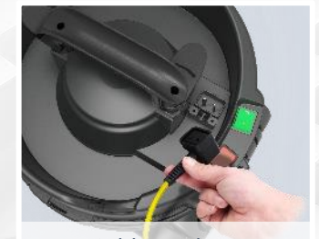
Easy Cable Replacement